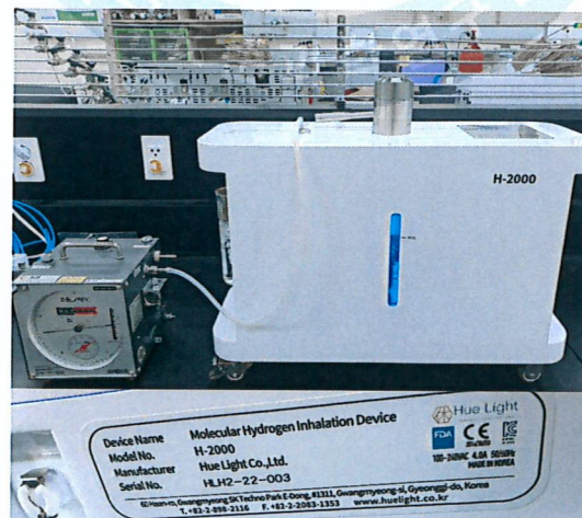
Fig. 1 Equipment configuration installed in KRISS at Hue Light Co., Ltd. (Continue to page 3)